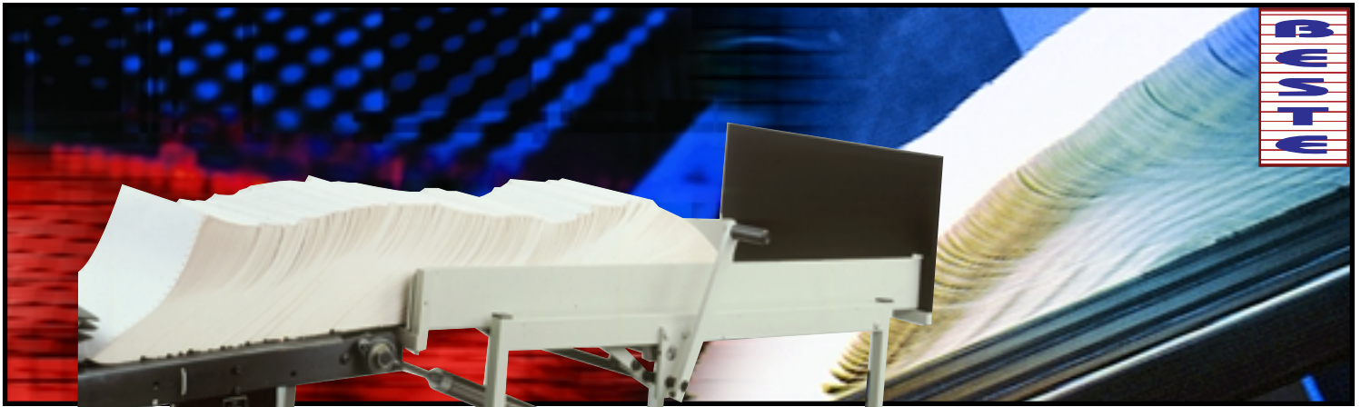
Rollaway Forms Transport Cart

Attaches to the delivery table of a Bunch Folder.