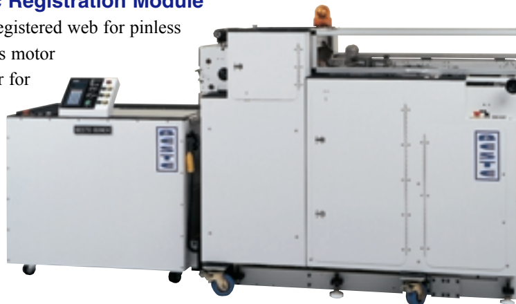
Pinless trimmer, cutter, stacker

down stream pinless devices such as punch and perf processors, folders, T/C/S units.