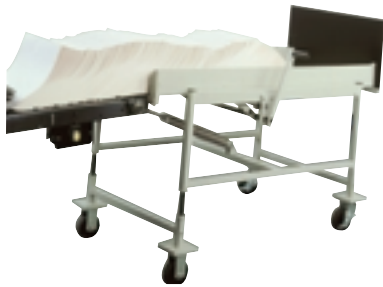
Forms Transport Cart...fills...