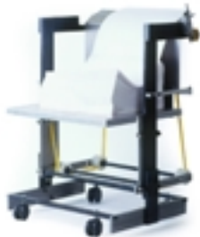
Rollaway Descending Stacker